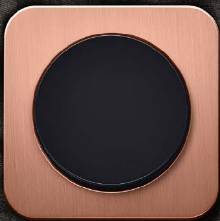
berker R.1 brushed copper