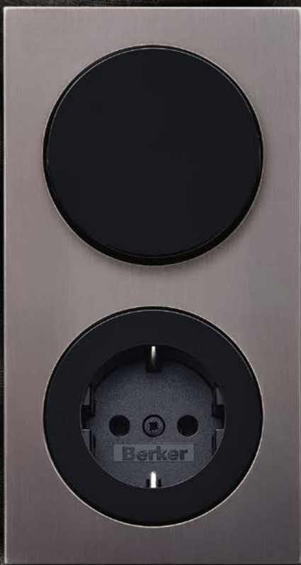
berker R.3 stainless steel, black-chrome, matt