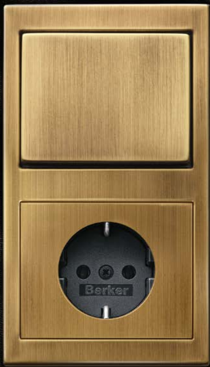
berker K.5 burnished brass