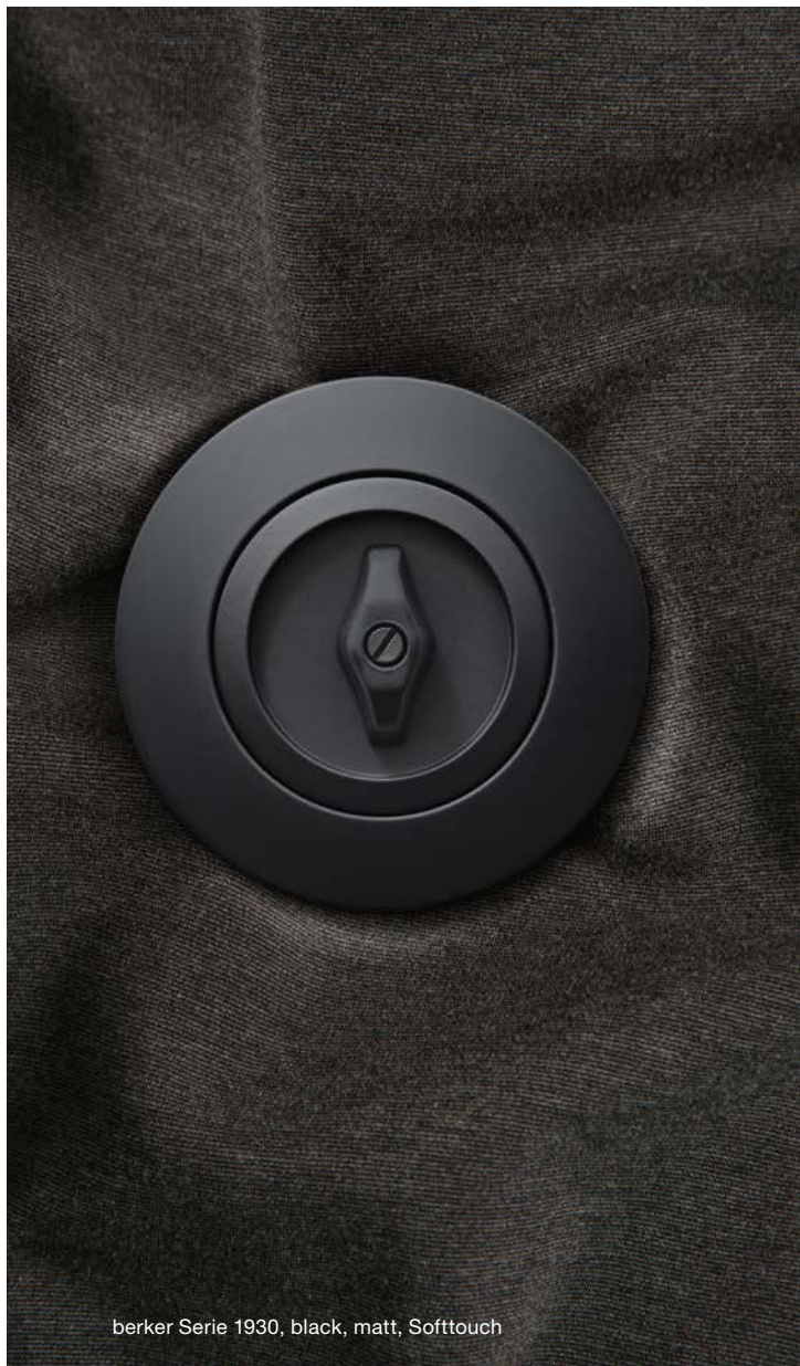
berker Serie 1930, black, matt, Softtouch