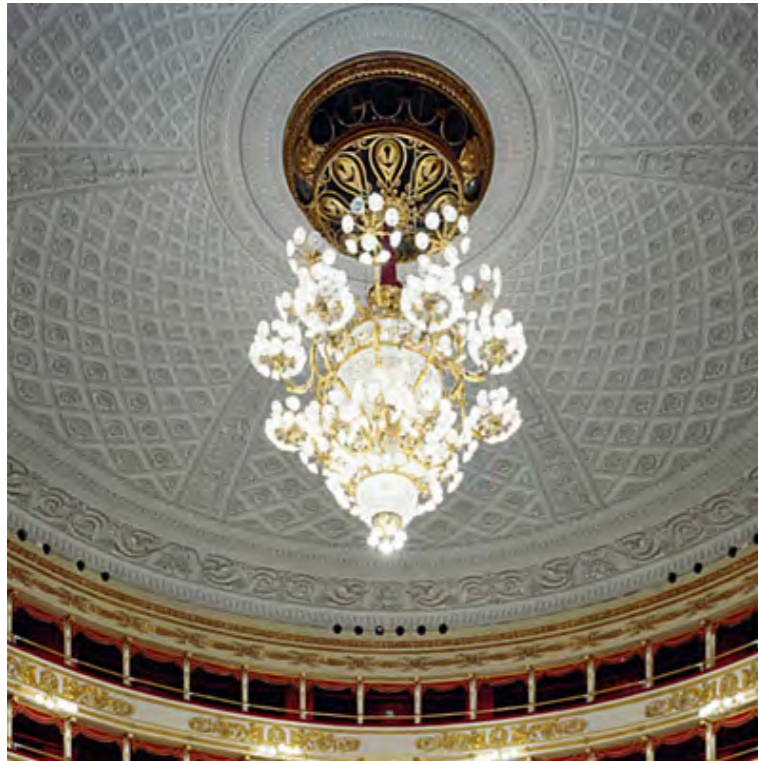
1. ORIGINAL CHANDELIER